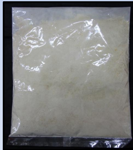
Xanthan gum production technology