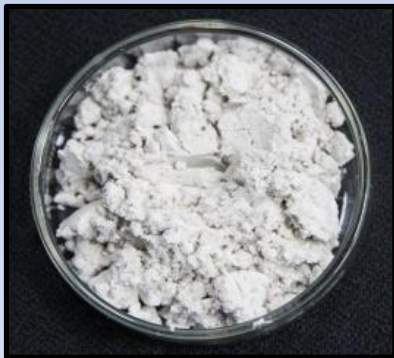
Radiation depolymerised guar gum for making encapsulated flavour powder (solid state)