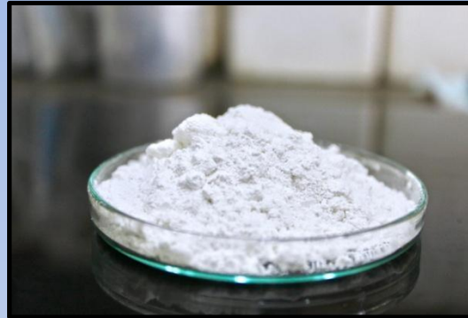
Oxocatalyzed biodegradable Films