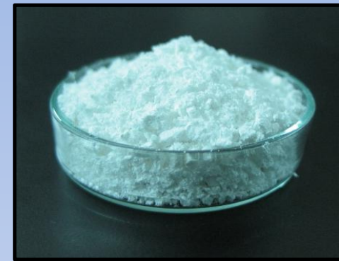
Radiation hydrolyzed guar gum as dietary fibre