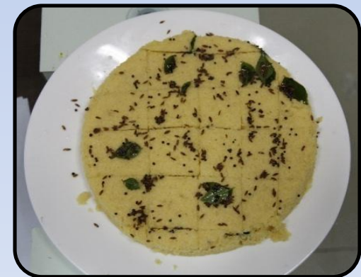
Psyllium (dietary fibre) fortified Dhokla