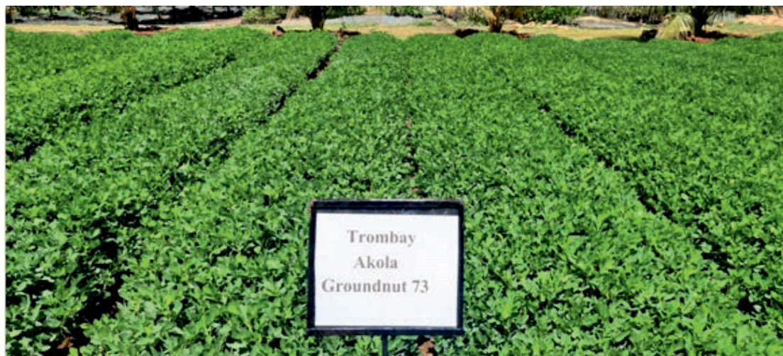
Fig. 1: Field demonstration of groundnut variety TAG 73 in Maharashtra

more than 2500 tonnes breeder seed of TG varieties was produced and supplied by BARC and other agricultural universities for further foundation and certified seed production in Andhra Pradesh, Gujarat, Karnataka, Madhya Pradesh, Maharashtra, Odisha, Rajasthan, Tamil Nadu, Uttar Pradesh and West Bengal. Most of these TG varieties have considerably benefited thousands of farmers, traders and exporters. Commercially, several crores worth of TG varieties were traded in many groundnut markets.