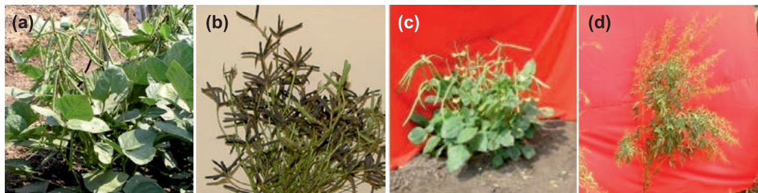
Fig. 3: Plants of mungbean variety, TRCRM-147 (a), urdbean variety, TJU 339 (b), cowpea variety, TC-901 (c) and pigeonpea variety, TJT-501 (d)

yellow mosaic virus resistance and suitability for summer cultivation. The early maturing pigeonpea variety, TJT-501 occupies almost 60% of the area under pigeonpea in Madhya Pradesh. The farmers of Maharashtra are reaping high yields by cultivating pigeonpea variety PKV-TARA especially under drip irrigation [3].