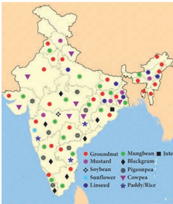
Fig.5. Deployment of Trombay varieties across the country.

BARC has followed multi-pronged approaches to disseminate Trombay varieties wide across the country. It has participated in exhibitions, Kisan Melas and conducted field demonstrations under the Public Awareness Programme on Peaceful Uses of Atomic Energy in order to create awareness about the Trombay varieties. As per the national indent from various seed agencies and seed growers, nearly 1000 tonnes of breeder seed of Trombay varieties were multiplied and supplied to National Seed Corporation, State Seed Corporations of Andhra Pradesh, Bihar, Chhattisgarh, Gujarat, Maharashtra, Odisha, Rajasthan and West Bengal; National Institutes; State Agricultural Universities; State Agricultural Departments; Seed companies; Non-Governmental Organizations and farmers. Apart from this, different State Agricultural Universities also distributed hundreds of tonnes breeder seeds of BARC crop varieties. Such of the seed was further multiplied, distributed and spread horizontally to thousands of hectares and widely accepted by the farming community in turn contributing significantly towards food and nutritional security of the country (Fig. 5).