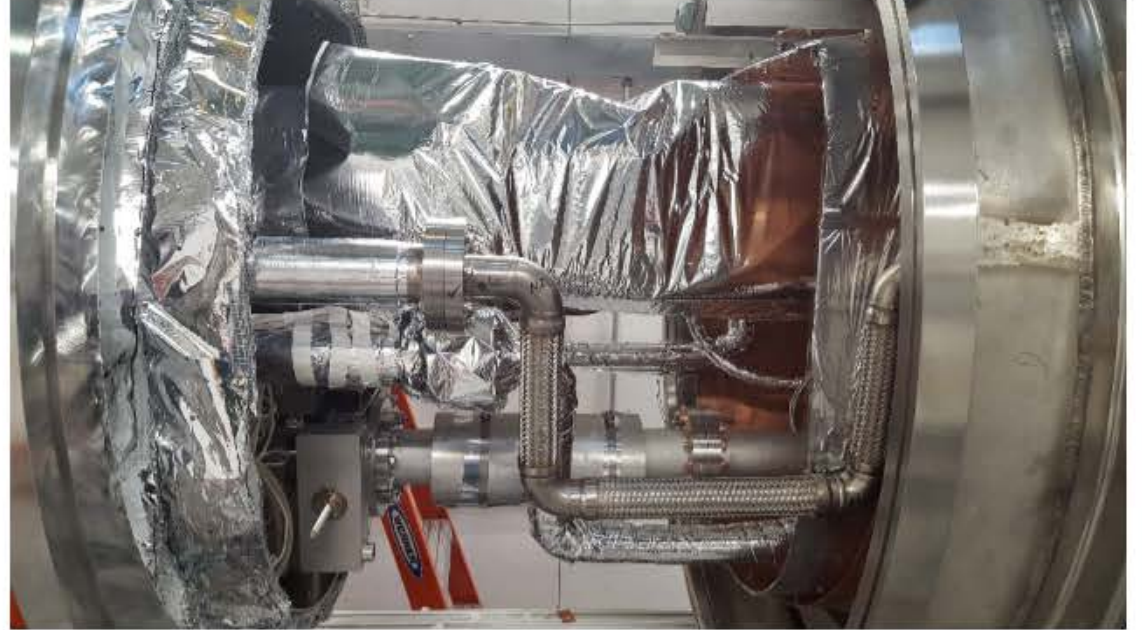
Feed Cap & End Cap Internal Cryogenic lines connection with Cryomodule