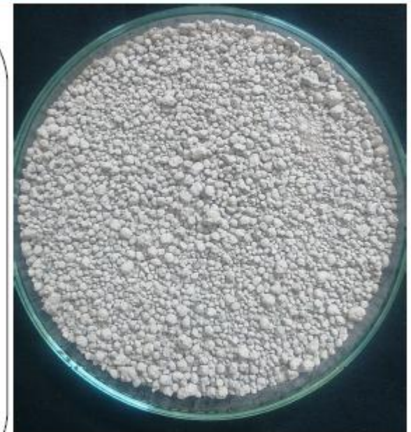
PHOSPHORUS FERTILIZER (17-18 % P_2O_5 )