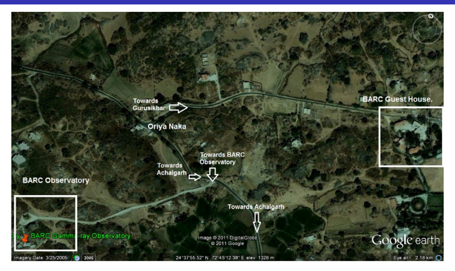
Figure: The TACTIC gamma-ray telescope @ Mount Abu, Rajasthan.