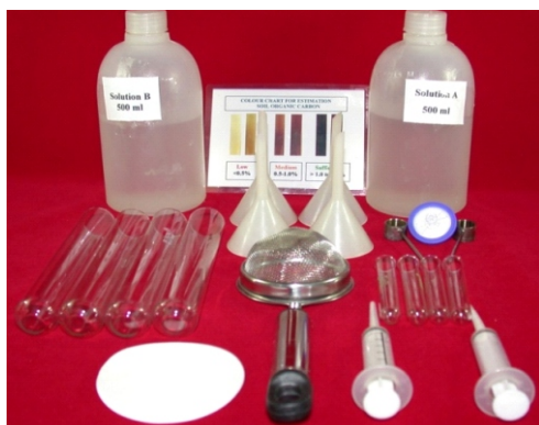
Fig.3: Different components of soil organic carbon detection kit.