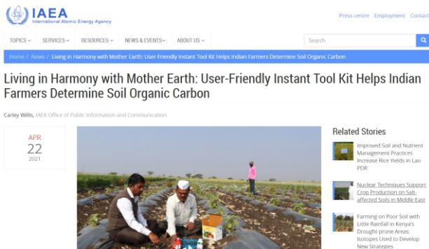
Fig.5: Technology published as impact story on IAEA Webpage.

Farmers have become more aware about ill effects of chemical day by day and consumers are also demanding organic foods. This kit is an excellent tool to test the organic nature of soil. As this is quick method and all the farmers can perform it on the field, then farmer doesn't have to rely on other agencies for the results. Organic carbon detection kit has become an important tool in organic agriculture which is going to be agriculture of coming years.