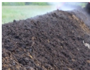
गन्ना उद्योग का कीचड़

2 होमी भाभा राष्ट्रीय संस्थान, अणुशक्ति नगर, मुंबई-400094, भारत