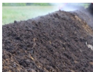
Sugarcane industry sludge

2 Homi Bhabha National Institute, Anushakti Nagar, Mumbai-400094, INDIA