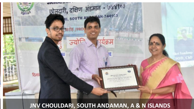
JNV CHOULDARI, SOUTH ANDAMAN, A & N ISLANDS

PILOT PHASE Jawahar Navodaya Vidyalayas across India