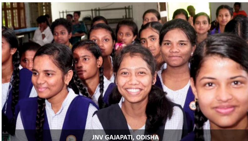
JNV GAJAPATI, ODISHA

PAN-INDIA COVERAGE Concurrent Execution at Multiple Locations for Effective Management