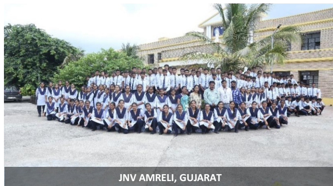
JNV AMRELI, GUJARAT

CALL TO ACTION Encouraging Next Generation to Engage with Parmanu Mitra as Elder Brothers and Sisters