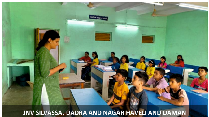
2-WAY EXCHANGE Gaining awareness Students' Aspirations, Spreading Awareness DAE Societal Technologies