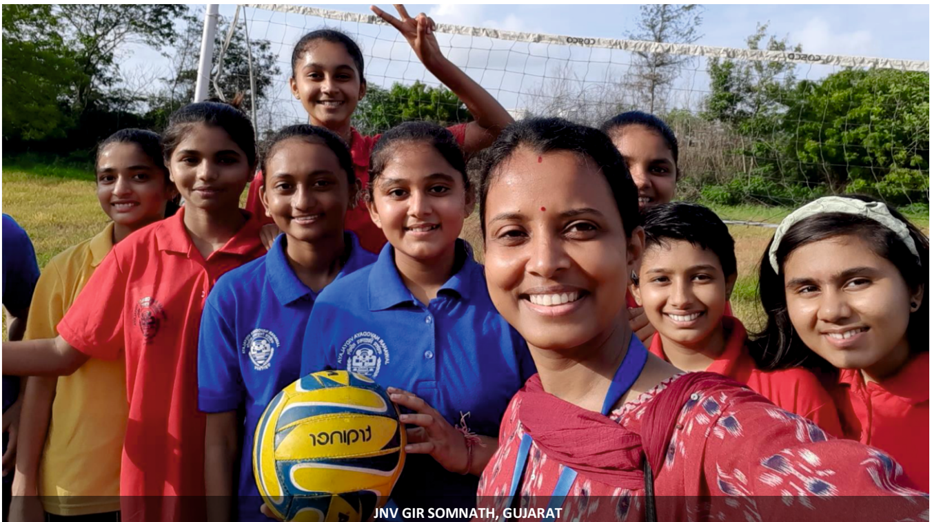
THE POWER OF INFORMAL BONDING Effective Engagement with Students, Overnight Stay at Schools