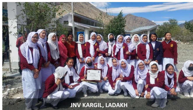
JNV KARGIL, LADAKH