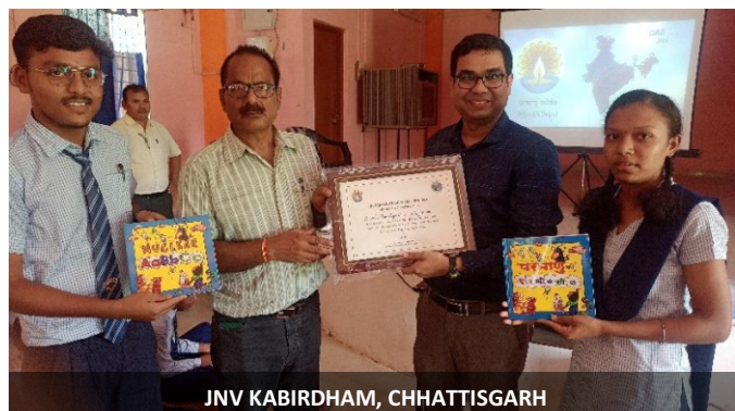
JNV KABIRDHAM, CHHATTISGARH