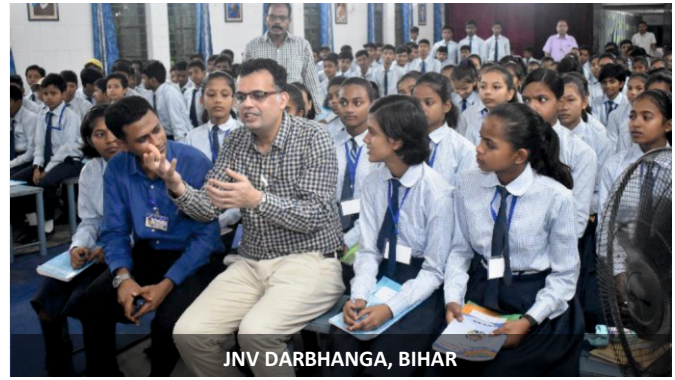
SCIENTISTS AS PARMANU MITRA Young scientists from BARC as the Ambassadors of Atomic Energy