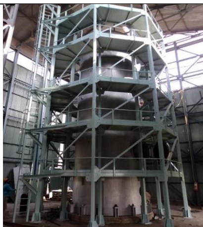
Hydrogen Recombiner Test facility at Tarapur