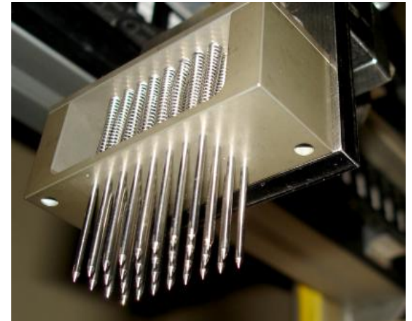
Pin tips assembly