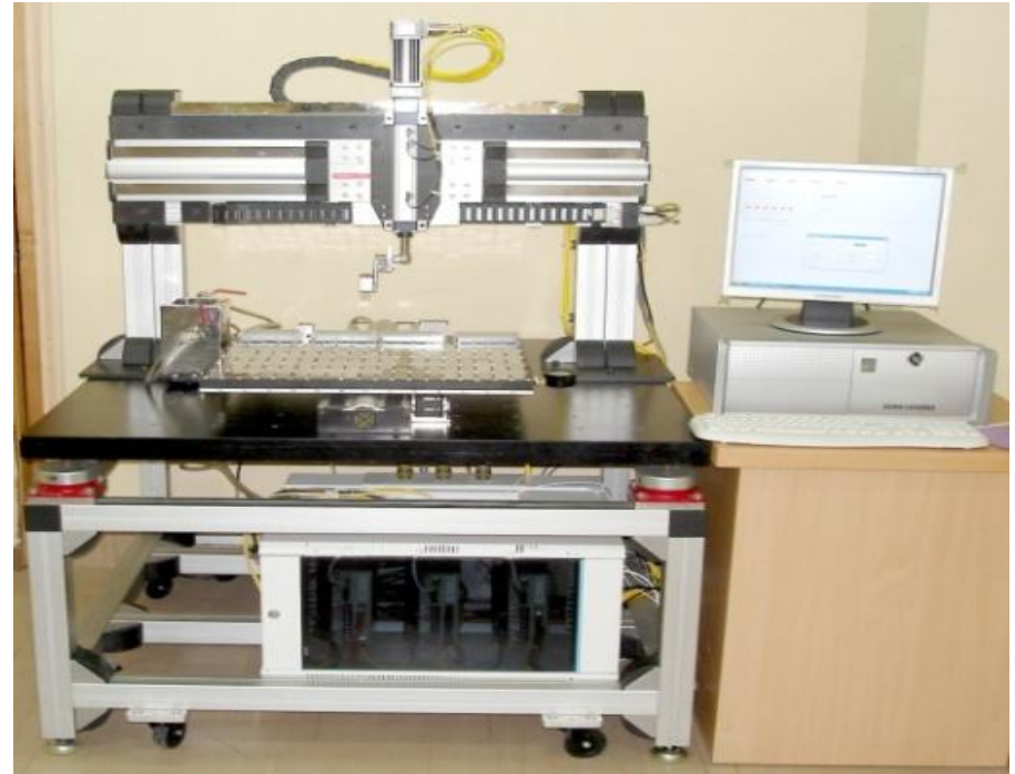
DNA Microarrayer System