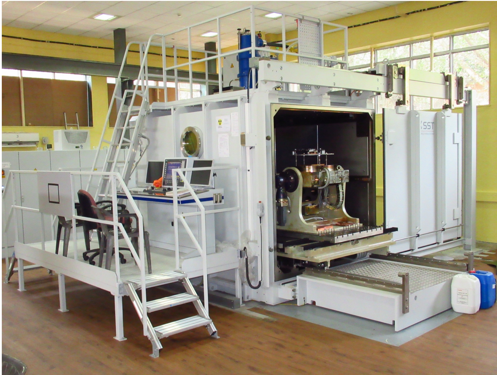
Fig: Computer controlled electron beam welding machine