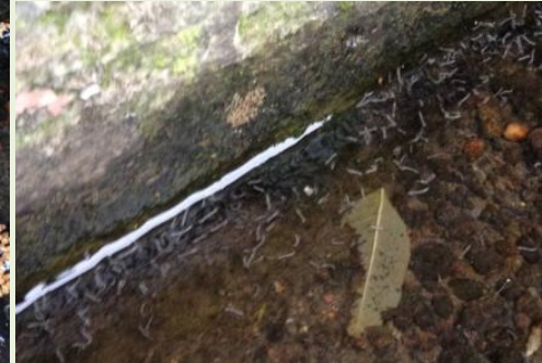
Efficacy of biopesticide