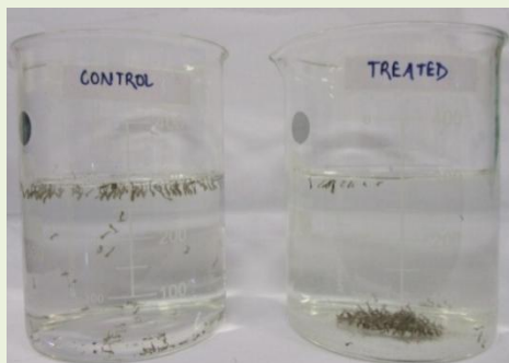
Untreated Bti treated