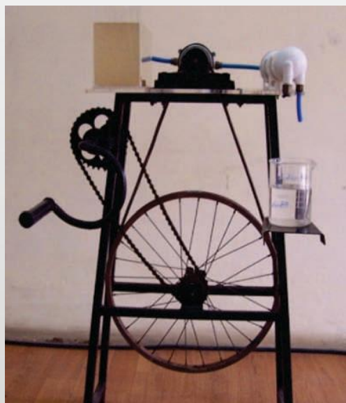
Hand driven UF Unit