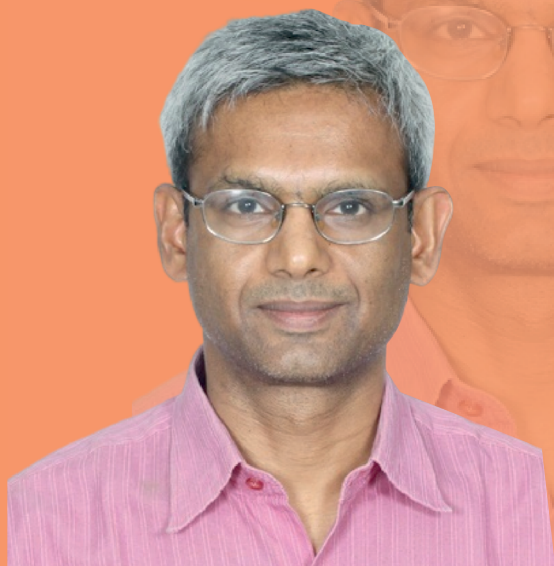
Prof. Jayaram N. Chengalur

Galaxies are not static, but evolve with time. One important process that takes place as galaxies evolve is the conversion of gas into stars. On a cosmic scale, it is well established that this star formation activity peaked about 10 billion years ago and that the average star formation rate of the universe has declined sharply since then. Atomic Hydrogen is the primary fuel for star formation, stars form as the gas cools to become molecular hydrogen, and then cools further and collapses under self gravity. Understanding the evolution of the atomic hydrogen content of galaxies is hence key to understand the evolution of the star formation rate with cosmic time. Unfortunately, because of the difficulties in detecting atomic hydrogen emission (via its best tracer, the 21 cm spectral line), until recently very little was known about the evolution of the gas content of star forming galaxies. I will discuss results from ongoing atomic hydrogen surveys of star forming galaxies using the upgraded Giant Metrewave Radio Telescope that have significantly added to our understanding of the evolution gas in galaxies.