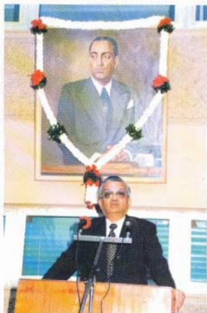
Dr Anil Kakodkar, Chairman, Atomic Energy Commission & Secretary, Department of Atomic Energy, addressing the staff on the Founder's Day

should be taken up in the tenth plan period. To facilitate networking of activities of different groups engaged in similar or complementary areas, we have divided our activities into six major programmes with identified key drivers for each one of them. I would like to use this occasion to urge each one of you to consciously contribute to these objectives in the spirit of teamwork and maximisation of synergy in our scientific research as well as between research and technology development. In the Department of Atomic Energy, we have considerable experience in converting our research efforts into successful large scale deployment. We must take these capabilities and their applications to greater heights. We know we can do it. Also we know that the nation expects this from us.