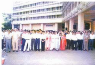
A section of the gathering of the staff at Trombay on Founder's Day

For designing the in-core shielding for intermediate sodium heat exchangers of the 500 MWe Prototype Fast Breeder Reactor, Apsara was extensively used for conducting a series of intricate experiments for optimization studies and validation of computational codes available at IGCAR by incorporating a Converter Assembly (CA) made of depleted uranium, leading to the creation of a facility for shielding experiments for Fast Reactors for the first time in India. Similarly, as a part of our AHWR development work, special experimental facility has been set up at APSARA to study flow pattern transition instability under two phase conditions, using real time neutron radiography and conductance probes.