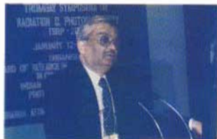
Dr Anil Kakodkar, Director, BARC, addressing on the day of inauguration of the symposium