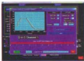
DAC setup menu