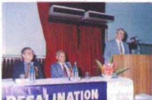
Dr Anil Kakodkar, Director, BARC, giving his inaugural address at the "Trombay Symposium on Desalination & Water Reuse-99 (TSDWR-99)"