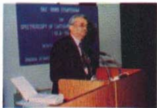
Dr Anil Kakodkar, Director, BARC, inaugurating the "Symposium on Spectroscopy of Lanthanides and Actinides"

Inaugurating the symposium, Dr Anil Kakodkar, Director, BARC, emphasised the importance of the spectroscopy of lanthanides and actinides in basic research and technology. As an example, he cited the importance of spectroscopy in the laser clean-up of Uranium-233 which is an important aspect of the thorium utilisation programme of DAE. He stated that the spectroscopy of lanthanides and actinides offers an opportunity to study some of the most fascinating aspects of foundations of physics and chemistry.