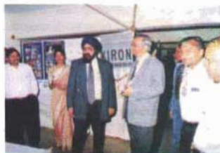
Dr Anil Kakodkar, Director, BARC, and other senior officers of BARC at the exhibition organised during TSDWR-99