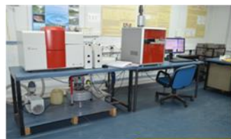
MS- EA and Multiflow