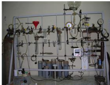
CO 2 preparation line